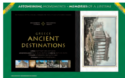
Dazzling Visual Book with an Exquisite Exact Replicas™ collection of 6 historic engravings of Ancient Greece 1801-1806.