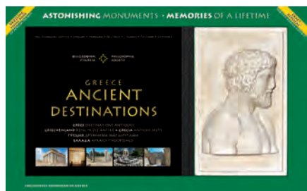
Dazzling Visual Book with an Exquisite Exact Replicas™ reproduction of Poseidon from Acropolis, Athens.